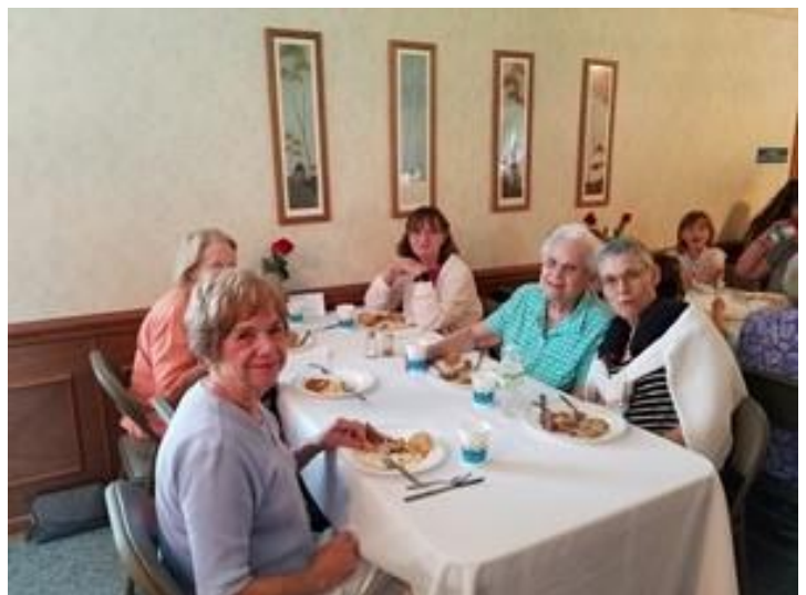
Mother Daughter Banquet