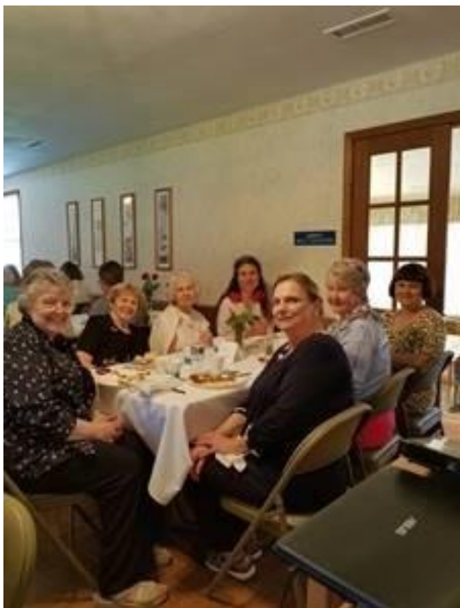
Gathering at the Mother/Daughter Banquet in May