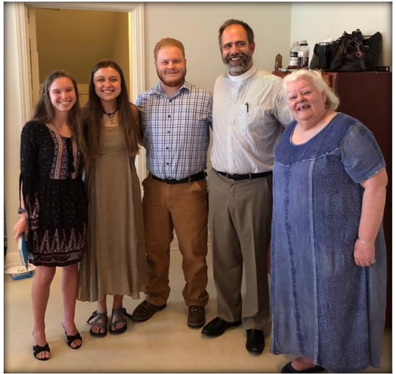
St. Mark's High School Graduates at coffee hour, May 26